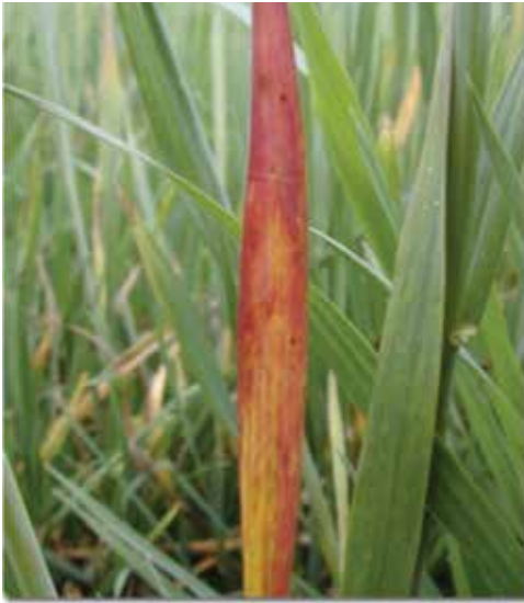
Oat plant infected with BYDV

BYDV: Also known as Red leaf, it is a virus that turns an infected leaf red or yellow and causes it to curl toward the midrib. The most common vector for BYDV is the Cherry Oat Aphid. BYDV is best controlled with genetic resistance variety selection. The newer varieties typically show resistance.