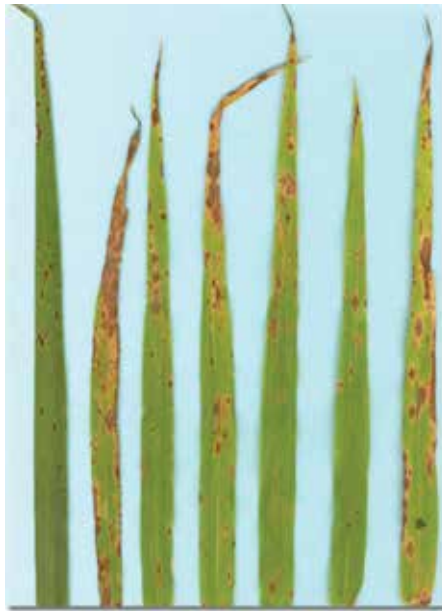
Oats infected with Septoria (Dept. of Ag. New Brunswick, Canada)

Septoria: A fungal disease that exhibits symptoms first as small spots on the lower leaves of seedlings. Spots grow into larger, lens-shaped lesions which are initially yellow and later turn reddish brown. 3 Lesions are first found on lower leaves within the plant canopy. Wet, warm, and humid conditions promote growth. Fungicide applications have been known to help control spread and damage of the disease.