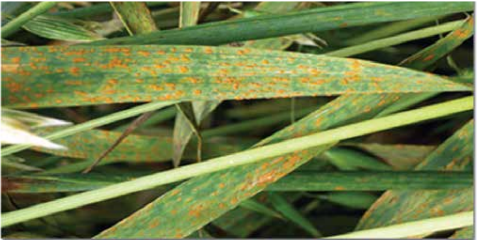
Crown Rust in Oats (Swedish U of Ag. Sciences, Dept of Forest Mycology and Plant Pathology)

Crown Rust: Symptoms of this fungal disease consist of red/orange-colored pustules forming on the leaves of the oat plant. Fields should be scouted during the late 4 leaf stage and into flag leaf. Fungicide control for crown rust is most effective when applied during flag leaf.